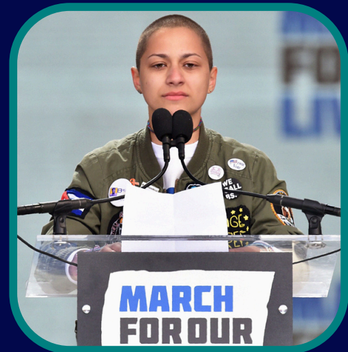
X GONZÁLEZ (1999 – Present)